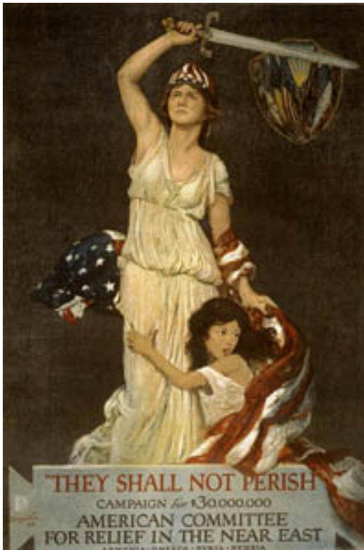
“They Shall Not Perish”