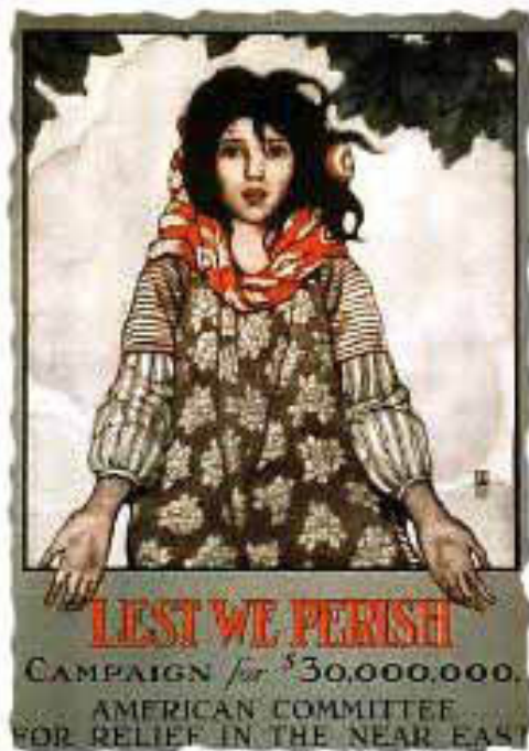
"Lest We Perish"